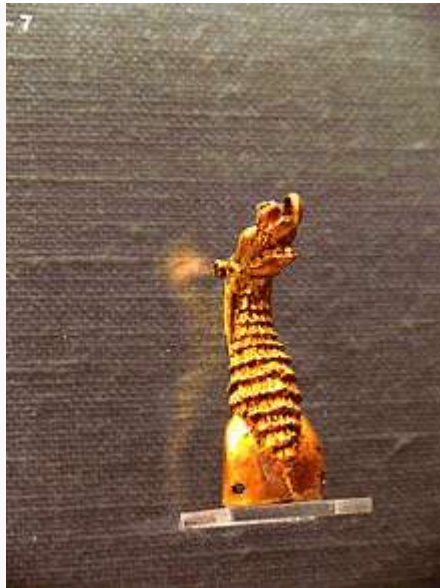
Fire-gilded dragon's head from Ireland, found in a Viking grave at Stavanger, Norway (Nationalmuseet, Copenhagen)

In 1003 the Danish King Sweyn Forkbeard started a series of raids against England. This culminated in a full-scale invasion that led to Sweyn being crowned king of England in 1013. Sweyn was also king of Denmark and parts of Norway at this time. The throne of England passed to Edmund Ironside of Wessex after Sweyn's death in 1014. Sweyn's son, Cnut the Great, won the throne of England in 1016 through conquest. When Cnut the Great died in 1035 he was a king of Denmark, England, Norway, and parts of Sweden. Harold Harefoot became king of England after Cnut's death and Viking rule of England ceased.